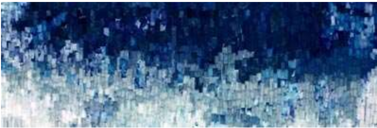
Lyndi Sales | What you see is just the tip of the iceberg (detail) | 330 x 330 cm | indigo dyed vlieseline , glue, string | 2014

The title of the project is a quotation from the cellist Yo-Yo Ma ; It reflects the artist's interest for the invisible, for systems and forces that underlie our world.