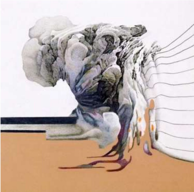
Min Jung-Yeon | La fin de la journée | 20 x 20 cm | watercolour, acrylic and Indian ink on paper | 2014