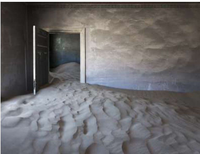
Helene Schmitz | The Blue Room | 98 x 128 cm | digigraphy | 2015

www.dunkerskulturhus.se/utstallning/platshallare-utstallning/borderlands/